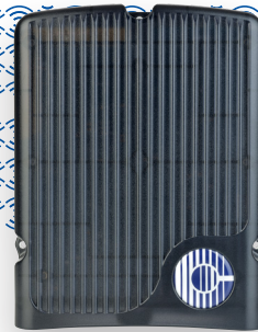
FreeSpeak II 1.9 GHz Transceiver Antenna